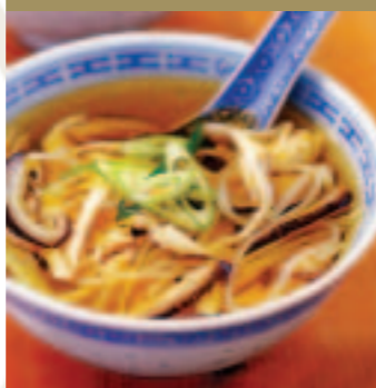
Chicken Noodle Soup