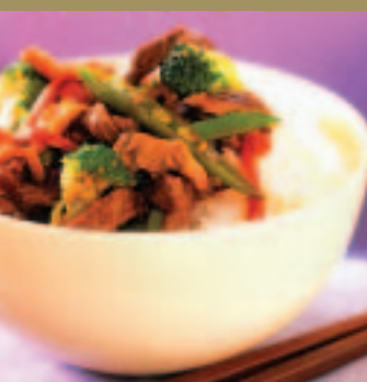
Beef with Oyster Sauce