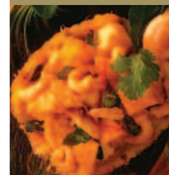
Three Delicacies in Whole Pineapple