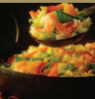
Fried Rice Dishes